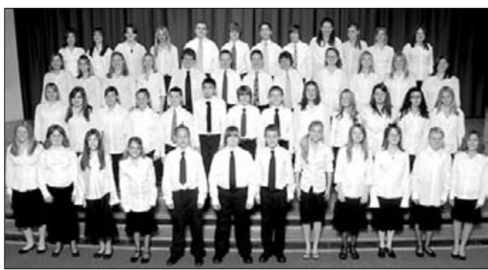
Junior High Chorus