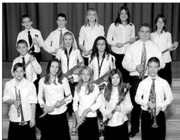
Junior High Band

chorus will present seven songs in a variety of styles