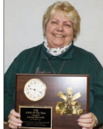
Carol Dennis EMS Award