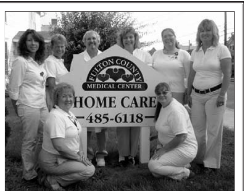
Home Care staff members open their office to the public at 213 South Second Street in McConnellsburg for free blood pressure screenings the first Tuesday of every month.