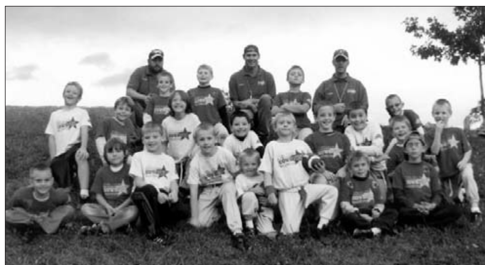
Fulton County Cowboys Silver & Blue Flag Teams