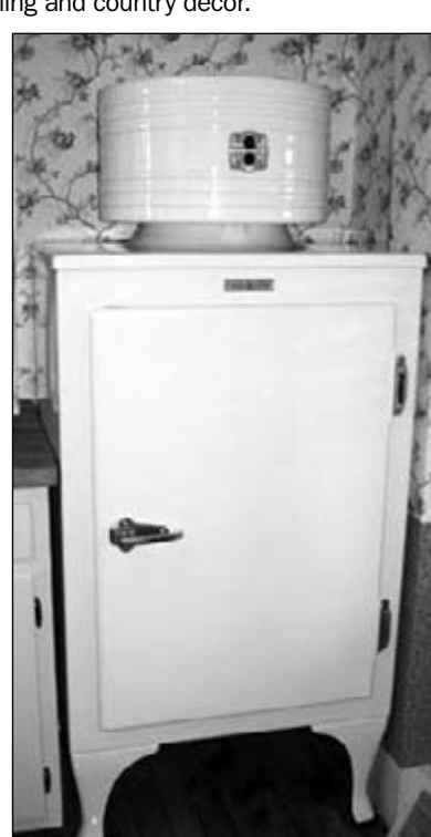
This working 1935 GE monitor-top refrigerator is one of the features of the restored 1930s-period kitchen at the Tenant House located on Shady Spring Farm near McConnellsburg.

Tickets for the house tour are $10 and can be purchased only at the Fulton House. A map with the homes' addresses is printed on the tickets. The house tour runs from 1 p.m. until 5 p.m. each day.