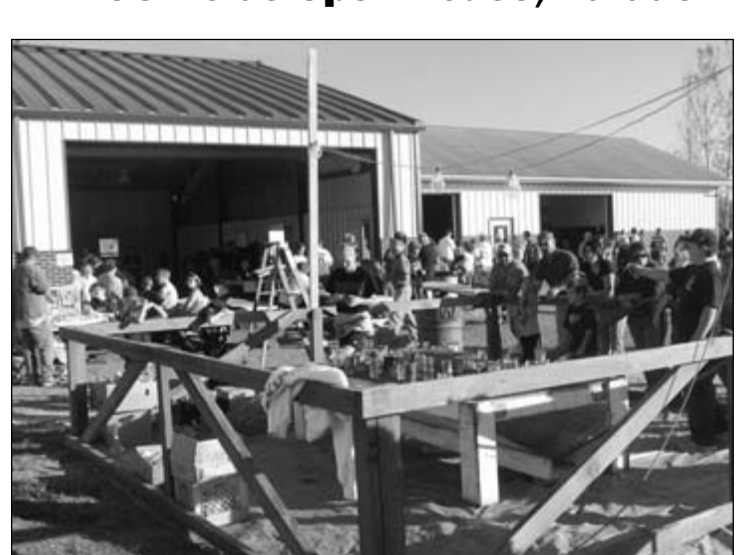
Needmore Volunteer Fire Co. invited the southern Fulton County community to take a look at its new equipment building (seen here at left) at an open house Saturday afternoon that followed the company's annual parade of fire equipment, majorette units, floats and the Southern Fulton High School band. Also on tap for the big celebration were games and the fire company's famously good festival food.

SUBSCRIBE TO THE FULTON COUNTY NEWS $25 In County $30 In Penna. $35 Out Of State Start Your Subscription Today! Call 717-485-3811