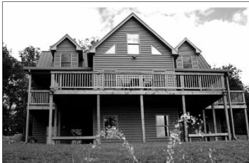
Nadine and Charlie Carbaugh's mountaintop home overlooking McConnellsburg is one of the homes showcased in this year's Fall Festival house tour.

The two-story house features an open floor plan, tongue-and-groove knotty pine walls and exposed beams. Its exterior is covered in vinyl that replicates log siding, a feature that keeps maintenance to a minimum. A wide deck on the first floor provides a great spot for the family retreat's main attraction, a spectacular view of the Great Cove, which should be